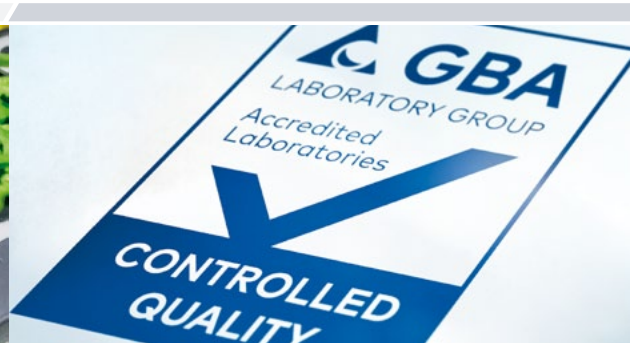
GBA GROUP Analyses of Fruits and Vegetables